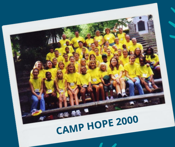
CAMP HOPE 2000

From 7 to 20 interns enrolled in I4T (established 2009)